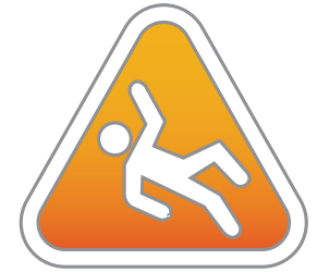
Fall risk patient