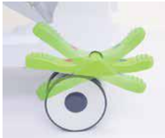
Four casters with central brake

Built-in bed extender increases patient comfort and caregiver efficiency.