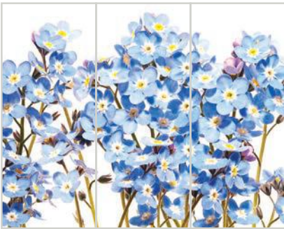
Floral Wall Panel Design

Steel and glass walls are a growing trend in hospitals due to their hygienic qualities as well as compelling design. The EASE art catalogue includes more than 200 graphic motifs, mainly inspired by nature, because of its soothing effect on patients and hospital staff. Our team is here to help you choose the optional colors and graphics for your facility.