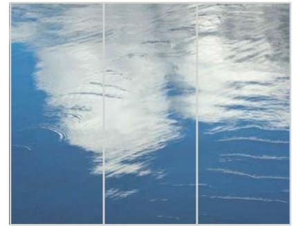
Nature Wall Panel Design