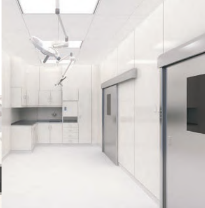
Staff & Patient Prep Rooms