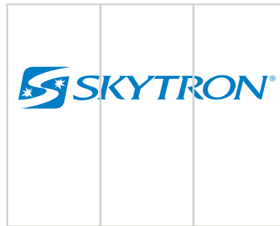
Logo Wall Panel Design